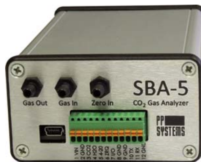
SBA-5 with enclosure (Accessories sold separately)