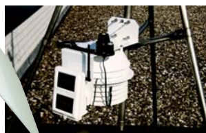
rain measurement according to the guidelines conversion kit 7440-WV with bracket to position the rain collector on the ground