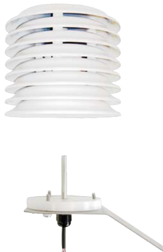
511-30 with Pt100