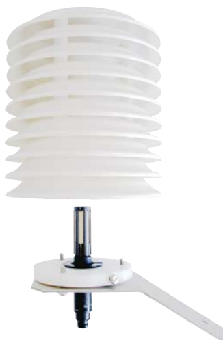
511-30 with Rotronic HygroClip