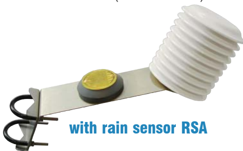
with rain sensor RSA