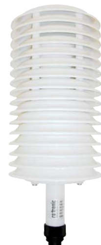
511-30 with Rotronic MP400